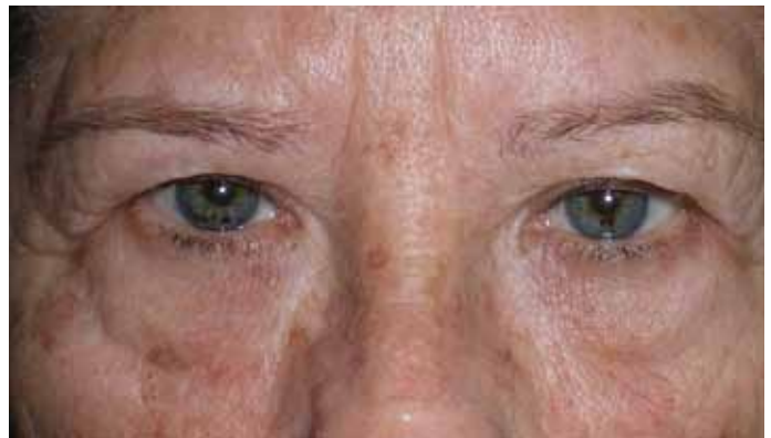
Figure 1. This image shows typical upper and lower eyelid aging changes. Reducing fat protrusion and rejuvenating the damaged skin are the goals of lower lid blepharoplasty.

Presurgical considerations are the same as outlined in the previous article on upper blepharoplasty. Patients must be screened from normal platelet and coagulation function. Lower lid tension or laxity is also critical to lower blepharoplasty success. Performing skin or muscle resection or skin on a lax lower eyelid can be disastrous in terms of aesthetics and function and many