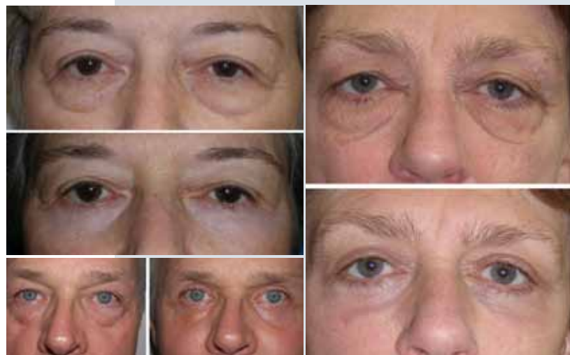
Figure 7. The top figure shows lower eyelid CO2 laser resurfacing performed after TC blepharoplasty. The bottom image shows another patient treated with 30% TCA peel

to be a safe and effective procedure in my practice for the past 13 years. Figures 8-10 show before and after images of lower eyelid blepharoplasty using the transconjunctival approach with skin resurfacing. ■