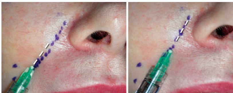
Local anesthesia is used for all filler injections. In folds or wrinkles, the 32-gauge needle is inserted deep into the fold, as not to distort the fold anatomy. Two injections of 0.2 mL to 0.3 mL of local anesthesia solution is threaded from the corner of the mouth to the nostril from two puncture sites. This will render the actual filler injection painless.

DEGREES OF PAIN More invasive cosmetic surgery procedures such as abdominoplasties also involve pain and