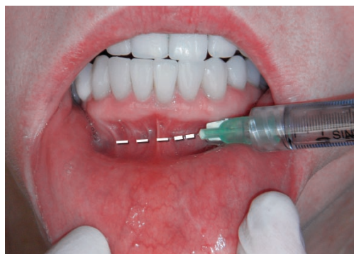
The “miniblock” infiltration technique involves using a 32-gauge needle with a 1 mL syringe. After topical anesthesia, the entire length of the needle is threaded near the sulcus to minimize puncture sites, and 0.2 mL to 0.3 mL of local anesthesia is injected in the right, left and center regions between the canine teeth.

the control of it. However, they are often erroneously associated with more intense pain compared to less-invasive aesthetic procedures. This false association can veer a prospective patient away from surgery.