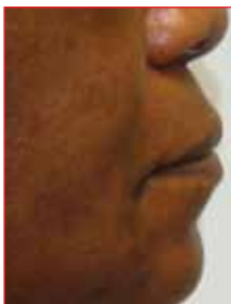
Patient after lip reduction