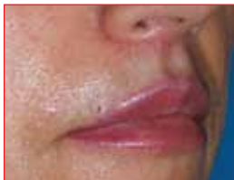
Patient after subcutaneous lip lift. Note the difference between the length and pout of the lip after the procedure.