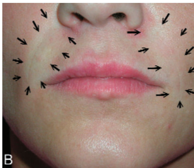
Figure 3. (A) The black dots show the skin surface of the nasolabial fold, and the white dots show the corresponding injection points for the mucosal side of the nasolabial folds. B shows the blanched areas outlined by arrows to illustrate the extent of the area anesthetized.