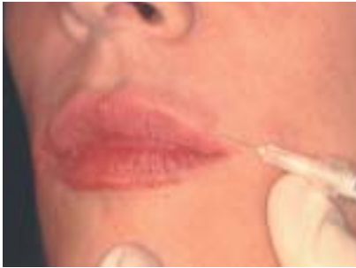
Figure 5 —Injectable collagen augmentation of the white-roll area in the upper lip.