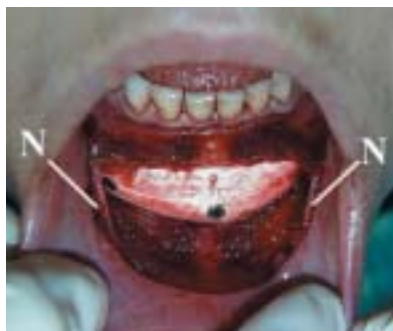
Figure 14 —A GORE-TEX® chin implant has been placed through an intraoral incision. Note the mental nerves (N) that have been preserved laterally.