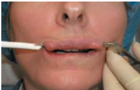
Figure 10C —The implant ready to be passed back through the tunnel.

be implanted in the lips to add definition or volume. Figure 10 shows a polytetrafluoroethylene implant (Advanta™ Facial Implant®) inserted into the lip for augmentation. Small stab incisions are made at the commissures, and the lip is tunneled with a passing instrument. The Advanta™ implant is then pulled through the tunnel as a permanent implant. Healing usually takes 3 to 5 days. The implant is permanent but may be removed if necessary. Figure 11 shows a patient before and after upper and lower lip augmentation with Advanta™ implants.