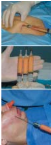
Figure 8 —Top: Liposuction fat harvested from the abdomen. Middle: Harvested fat in the middle of the tubes after centrifuging. Bottom: Harvested fat being injected into the lip and nasolabial fold.

drawback of only lasting for 2 to 3 months. One of the most exciting and anticipated treatments for lips, lines, and wrinkles are the new fillers soon to be approved by the Food and Drug Administration (FDA). RESTYLANE ® and PERLANE ™ are nonhuman-derived hyaluronic acid. These substances are molecular sugars derived from bacterial culture. Because they are nonhuman, no allergy testing is required. The most desirable quality of RESTYLANE ® and PERLANE ™ is that they last considerably longer than collagen—from 8 months to 1 year, depending on the site of injection. RESTYLANE ® is usually used in the lips, whereas PERLANE ™ has a larger particle size and is used for deeper lines and wrinkles. Some media mistakenly have claimed these substances are a replacement for Botox. However, a filler merely plumps whereas Botox chemically denervates motor nerves to induce facial muscle softening.