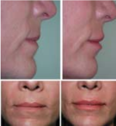
Figure 7 —Before and after images of a patient treated with Zyplast (bovine collagen). Notice the improved lip esthetics, including more volume, definition, and pout.