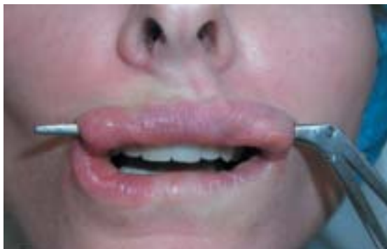
Figure 10B —The passing instrument making a tunnel in the upper lip.

augmentation with bovine collagen. The white-roll area, as well as the deeper tissues of the lip, was augmented to increase volume and definition. Note the improved “pout” from the augmentation.