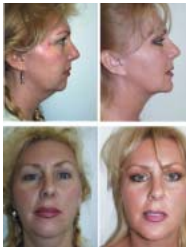
Figure 15 —Reduction of submental fat and profile improvement using submental liposuction and GORE-TEX® chin implant.

New and emerging technologies, as well as an expanded scope of practice, have influenced all aspects of general dentistry and the