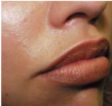
Figure 3 —A defined white roll of the upper lip, which accentuates the "Cupid's bow" form of the esthetic lip.