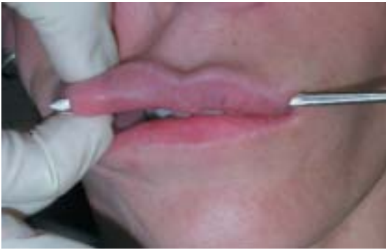
Figure 10D —The implant after it is passed through the tunnel.