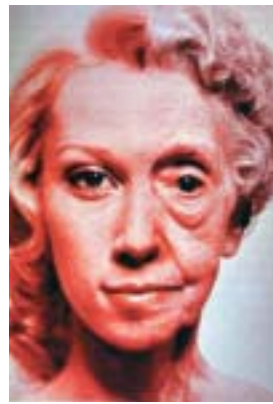
Figure 2 —The same patient's face in her 20s and 80s, illustrating the effects of facial aging.