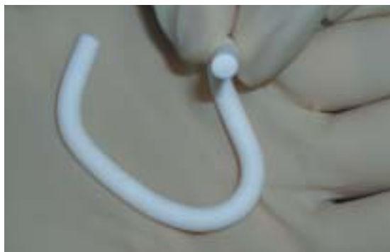
Figure 10A —Advanta™ implant.

Alloplastic materials such as expanded polytetrafluoroethylene (GORE-TEX®.f) can