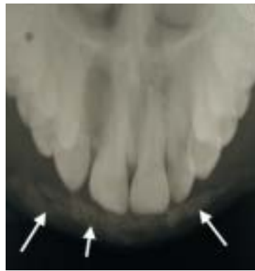
Figure 6 —Shows an occlusal radiograph of a patient after injection with Radiance™ FN. The radiopaque nature of the material is shown as thin wisps of hydroxyapatite, visible in the upper lip area.