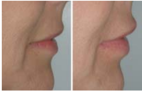
Figure 11 —A patient before and after use of Advanta™ lip implants. Notice the increase in volume, pout, and projection in the after-picture. This product will enhance cosmetic dental procedures.