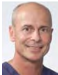
By Joe Niamtu III,

Cosmetic surgeons have rethought fat removal and volume replacement, and now realize