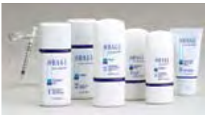
Obagi Nu-Derm Clear™ (Hydroquinone USP, 4%) Skin Bleaching Cream

Clinicians who have experience with the 532-nm diode laser are familiar with the immediate disappearance of the ectatic vessel after laser-light exposure. The longer 532-nm diode laser pulses heat the blood more gently and damages endothelial cells, but does not burst vessels, as evidenced by the lack of purpura. The 532-nm wavelength, which is strongly absorbed by oxyhemoglobin, is pre-