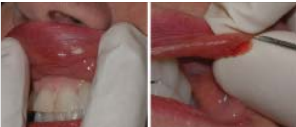
Figure 2. In this example of overtreatment an area of filler that has been overfilled is extruded after puncture with an 18-gauge needle.

Regardless of these minor drawbacks, a pain-free procedure benefits both surgeon and patient.