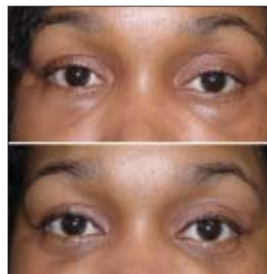
Figure 3. Patient shown with excess filler in the tear trough regions 24 hours after hyaluronidase injection.

When a patient presents with an over-filled area, conservative treatment should be employed. Sometimes, regardless of the filler, simply having the patient manually massage the overfilled area in the direction of the normal side can reduce the area of excess. Another way to deal with excess filler is to make a puncture over the