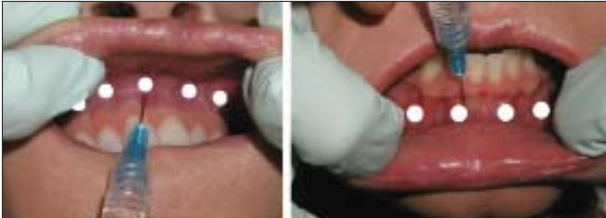
Figure 1. The injection points for the “mini block” technique—0.2 cc’s of local anesthesia injected in the perisulcular region, from the canine tooth one side to the canine tooth on the other side in each jaw.