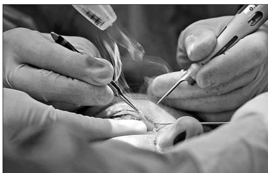
Niamtu's steady hand uses a laser knife to remove small patches of skin and fat from Dunham's eyelids. An assistant uses a surgical vacuum to suction away the smoke and smell of burning flesh.