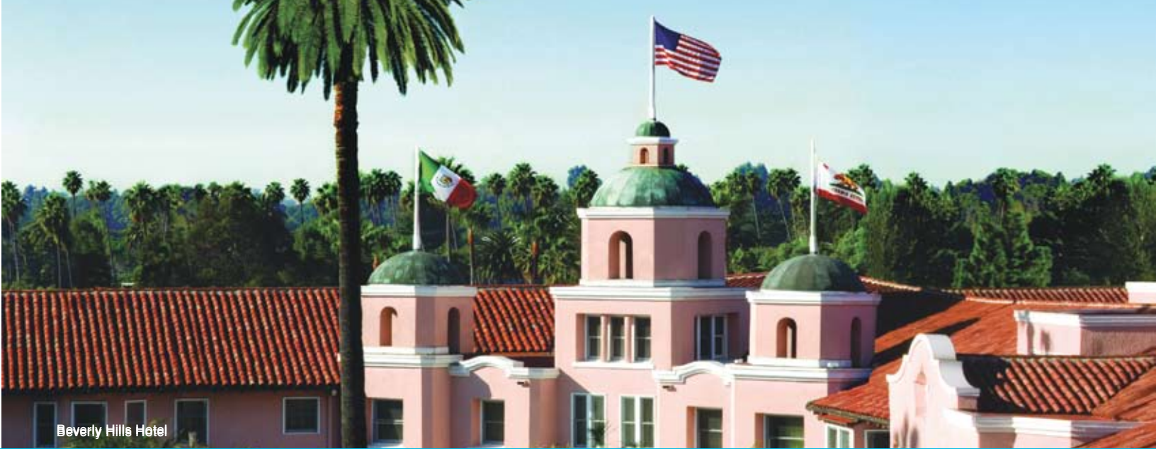
Beverly Hills Hotel