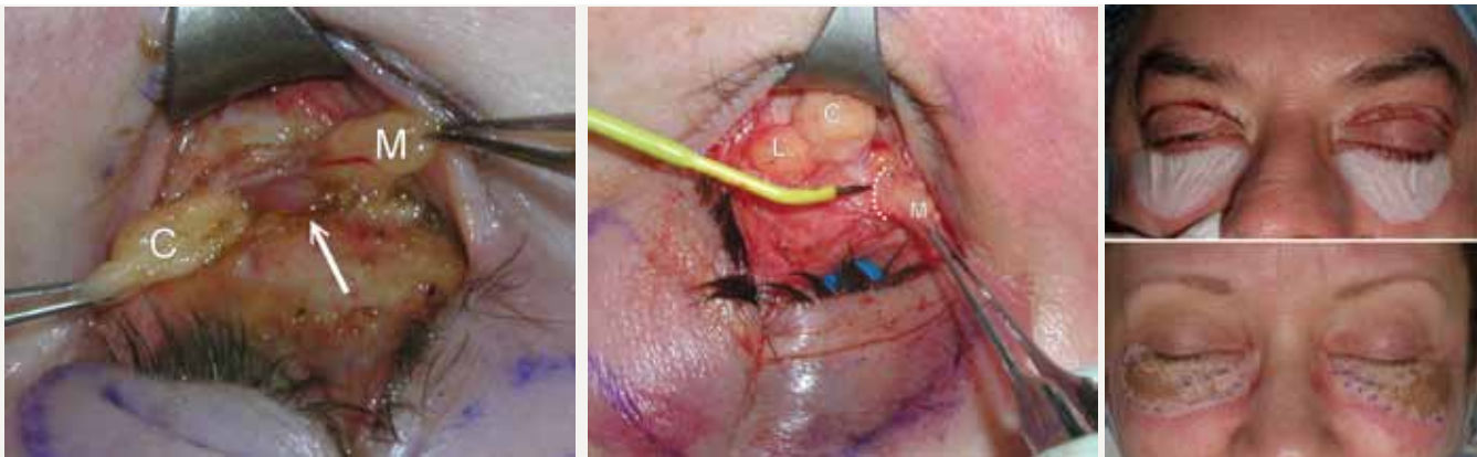
Figure 4. Figure 4 (left) shows the approximate transconjunctival approach to the lower periorbital fat pads and the right sided figure shows the position on a patient. Figure 5. This image shows the "surgeons view" of lower transconjunctival blepharoplasty. The central fat pad is shown as "C" and the medial fat pad is shown as "M". The white arrow points the inferior oblique muscle that separates these two fat compartments. Figure 6. A radio-wave microneedle is used on the pure coagulation mode to incise the base of a medial fat pad. The central (C) and lateral (L) fat pads are also shown.

This article is only a synopsis of popular blepharoplasty technique and does not represent all available options options. As with any procedure, various surgeons prefer various approaches. The TC approach with simultaneous lower lid skin resurfacing has proved