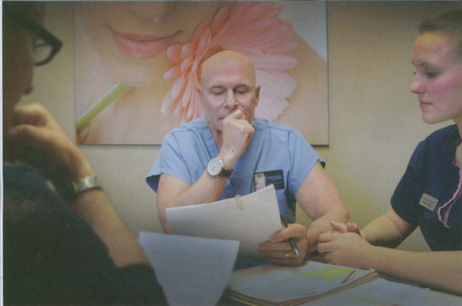
He is very serious about his patients.