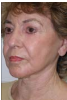
Figure 5. This patient underwent facelift and aggressive laser over the central oval of the face, with lower-density CO 2 resurfacing over the undermined facelift flaps and neck. The laser enhances the facelift and vice versa.

provides many advantages to the procedure.