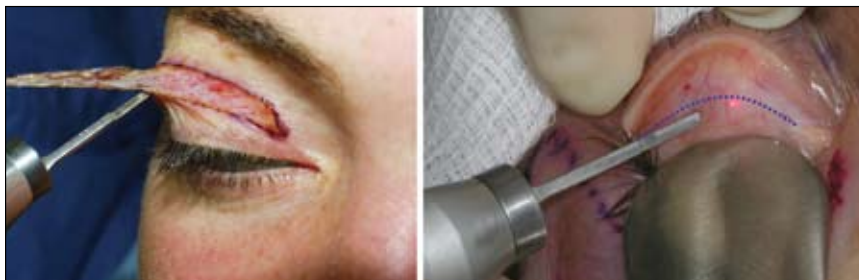
Figure 3. The CO 2 laser provides a bloodless incision modality for upper and lower blepharoplasty.