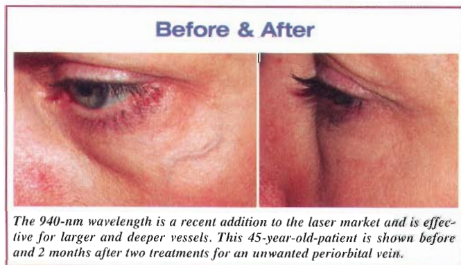
The 940-nm wavelength is a recent addition to the laser market and is effective for larger and deeper vessels. This 45-year-old-patient is shown before and 2 months after two treatments for an unwanted periorbital vein.

directly from a customized indium gallium arsenide diode laser and is chosen for larger and deeper vessels primarily because it is exactly at the peak of the secondary absorption band of oxyhemoglobin in the near-IR region of the spectrum. Since the target is venous blood, it is also important to consider the reduced hemoglobin absorption spectrum. Less strongly absorbed wavelengths penetrate more deeply, and can