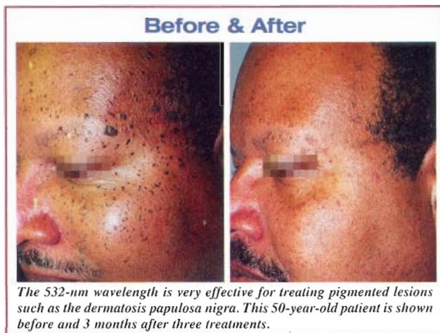
The 532-nm wavelength is very effective for treating pigmented lesions such as the dermatosis papulosa nigra. This 50-year-old patient is shown before and 3 months after three treatments.