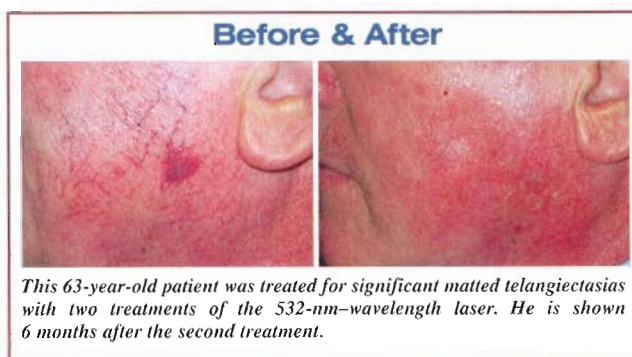
This 63-year-old patient was treated for significant matted telangiectasias with two treatments of the 532-nm-wavelength laser. He is shown 6 months after the second treatment.

Pigmented lesions such as lentigines, keratoses, ephelides, and dermatosis