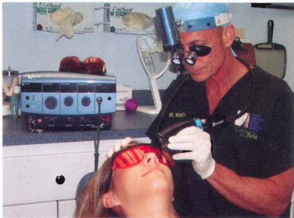
Figure 2: The new dual-wavelength, solid-state lasers are compact, lightweight, and portable.

on a potassium titanyl phosphate crystal to double its frequency. This halves the wavelength, producing the final 532-nm radiation.